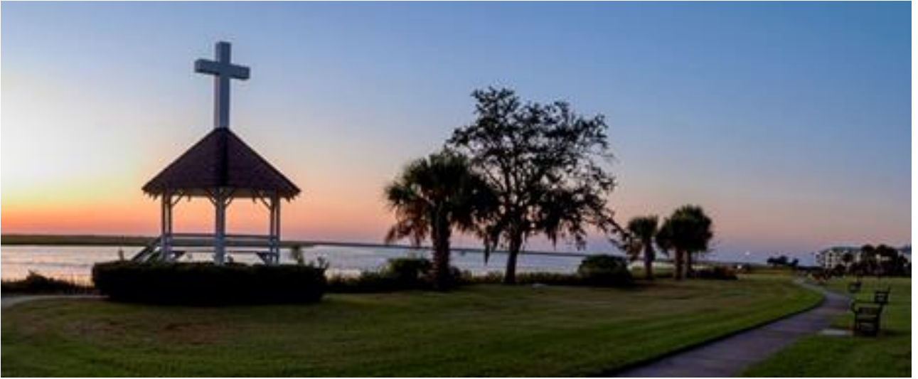
Gazebo: $500 (Wright Prayer Tower reserved as back up)

For more intimate celebrations of eighteen guests or fewer, the Wright Prayer Tower offers a sanctuary of quiet reverence, the perfect for your vows to be shared softly, surrounded only those closest to your heart.